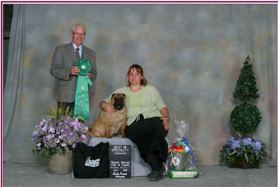
Best Veteran Am. Ch. MsJoy's She Walks with Angels